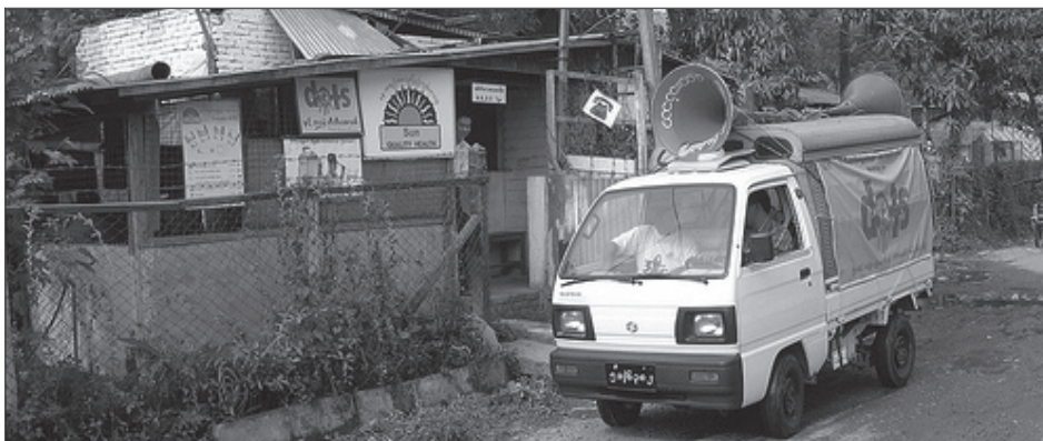
A mobile van promotes TB therapy at SQH, TOP and QC clinics.

Please see chart on page 4 for a flowchart of the referral process.