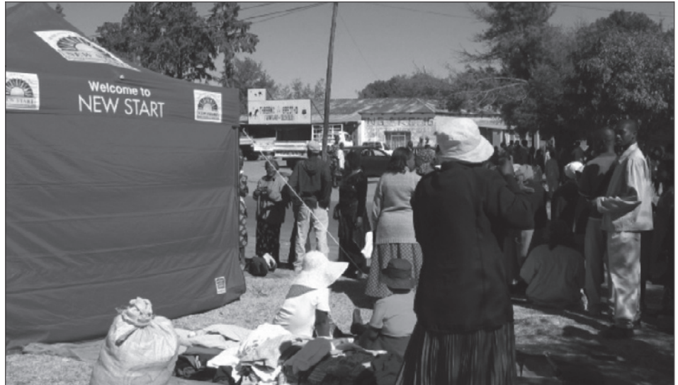
An outreach event organized by "Know Your Status" community-based counselors and supported by New Start counselors.