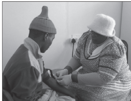
A New Start counselor draws blood for an ELISA confirmation test.

PSI Lesotho takes a comprehensive approach to training, supporting and monitoring New Start counselors. New Start counselors receive initial training prior to working at a center, followed by semi-annual refresher trainings, based on Lesotho government's guidelines and standard procedures outlined in the New Start manual. PSI Lesotho supervisors conduct monthly evaluations, using standard counselor evaluation forms. To ensure the counselors' well-being and to avoid burnout, external psychologists conduct quarterly sessions to support counselors.