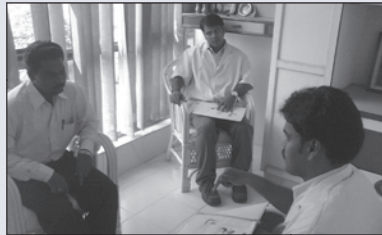
Counselor supervision in a Saadhan clinic.